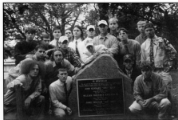
BETA UNDERGRADUATES PAY TRIBUTE TO THEIR FALLEN BROTHERS IN FRONT OF GREY CHAPEL ON SEPTEMBER 23.