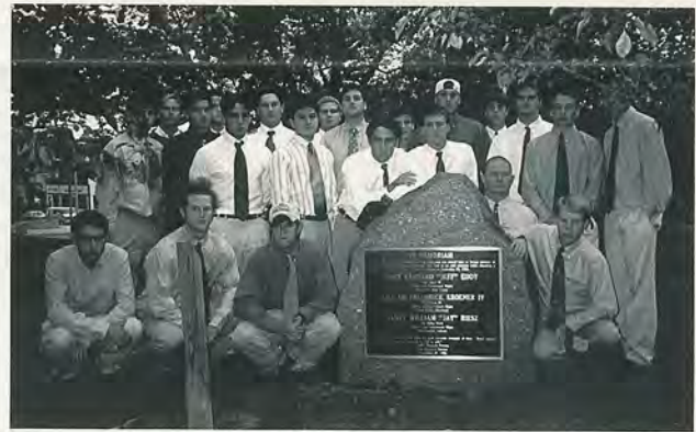
Betas paying tribute to their fallen Brothers.