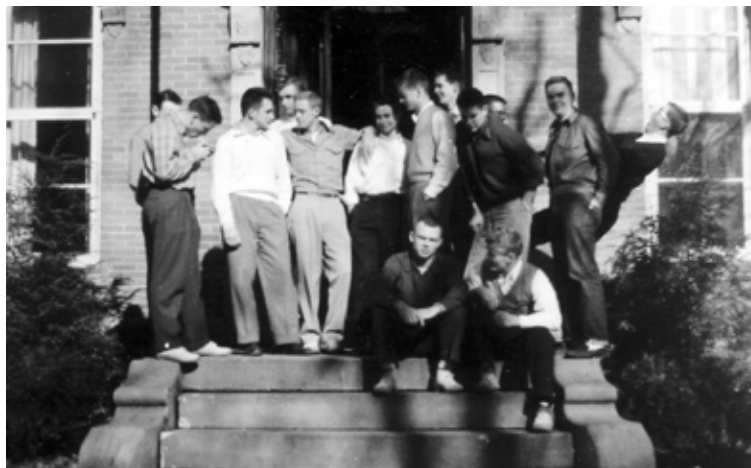
The Good Old Days — circa 1952