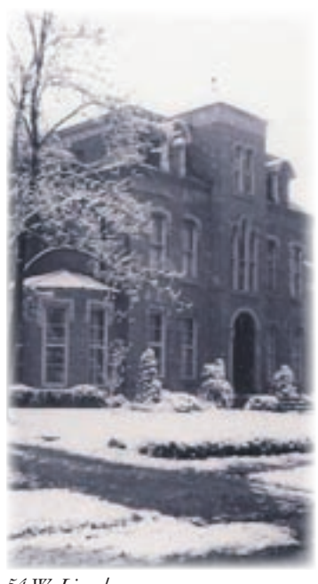
54 W. Lincoln