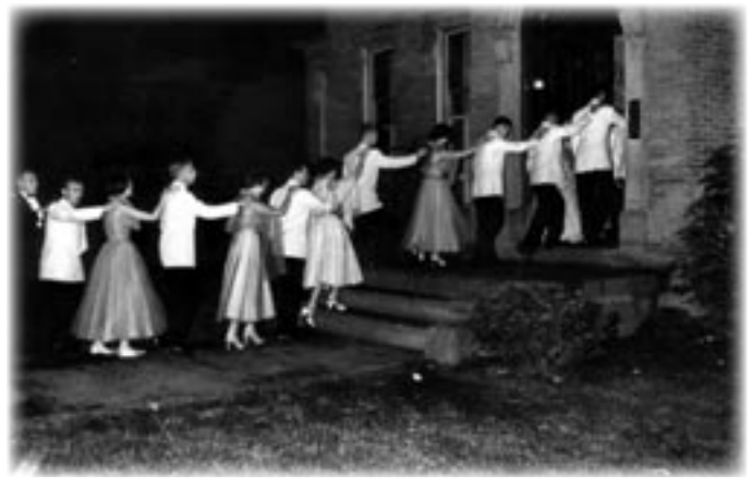
1955 Beta Sweetheart Ceremony at 54 W. Lincoln.