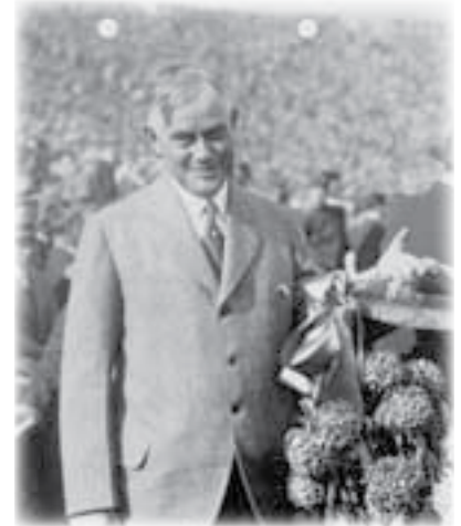
Fielding H. Yost

He began his coaching career at Ohio Wesleyan University and led them to the school's only victory over Ohio State. After leaving Ohio Wesleyan, Yost held brief coaching stints at the University of Kansas, the University of Nebraska and Stanford U. before accepting the position at the U. of Michigan, 1901.