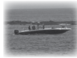
G. W. Bush, Sr. boating at Kennebunkport