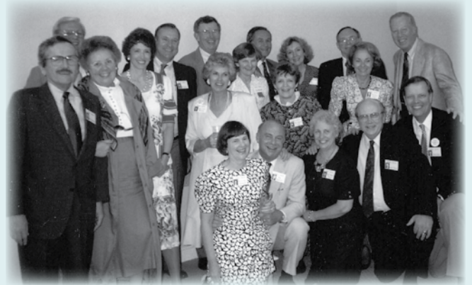
Class of '54 and spouses