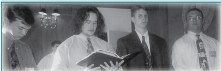
Circa 1999 - Can anyone identify any of these brothers? Send names to the Editor.