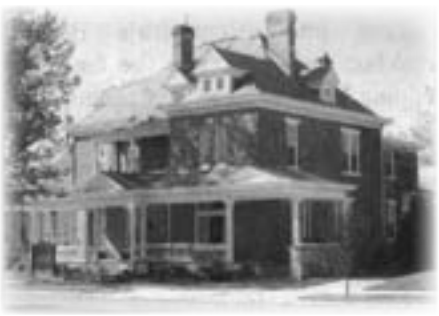
London Family House