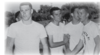
1957 Beta Intramural Champs

Bruce resides at 10492 Kerwick Ct., Reminderville, Ohio 44202 and can be reached at 330-963-6439 or bbcrittenden@aol.com