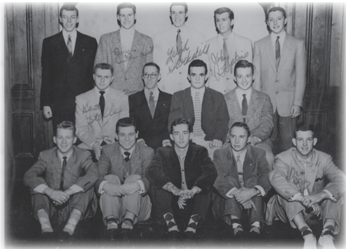
1957 Pledge Class