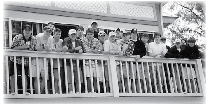
1996 from Springbreak, at the same place, with about 20 Theta Beta's and pledges.