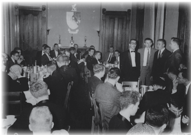
545 W. Lincoln Beta House Dining Room in 1957