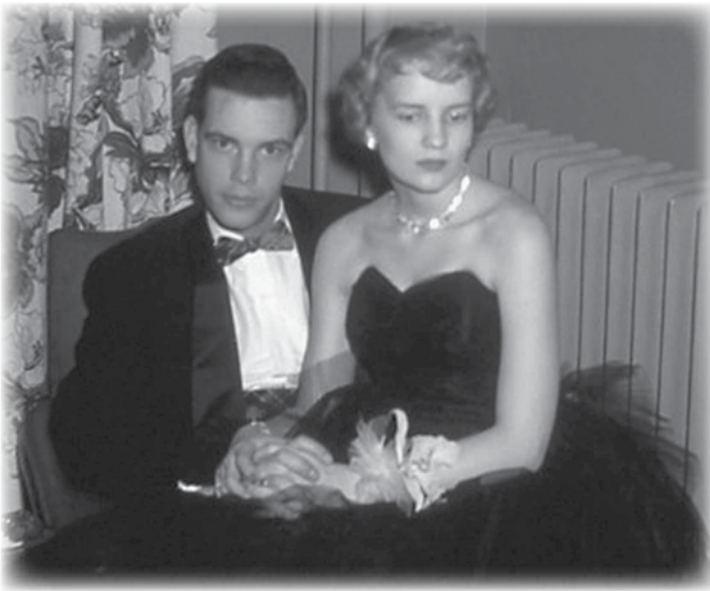
Dick DeVos and Berneita "Nita" Heyman DeVos at OWU.