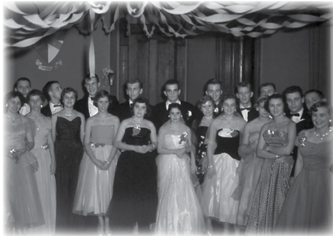
1955 Pledge Class Formal — What beauties!