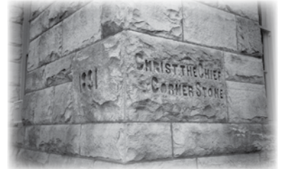
OWU Slocum Library Cornerstone