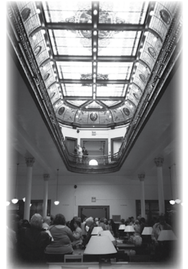
OWU Slocum Library Study Room