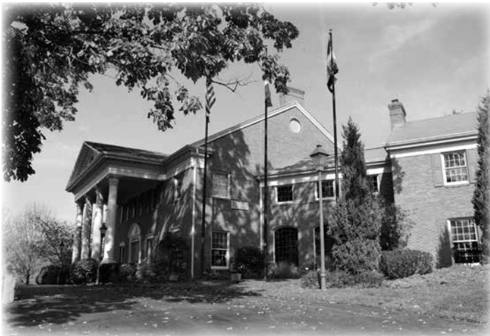
A front view close up of the Beta Hq in Oxford, OH