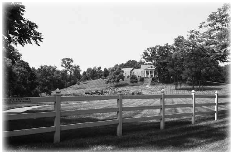
A front view of Beta Theta Pi Administration Building in Oxford, OH