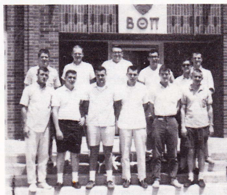
These sporting men represented Beta in basketball several years ago. Do you recall their names?