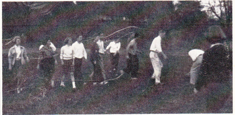
... let's have a huddle