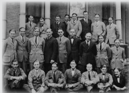
The Brothers — 1925