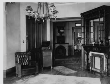
The music room and parlor