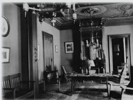
The living room