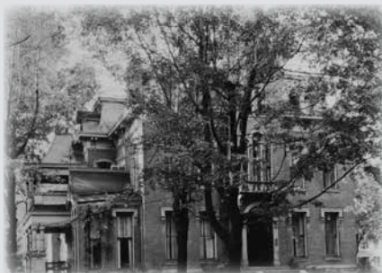
"The House" 54 W. Lincoln